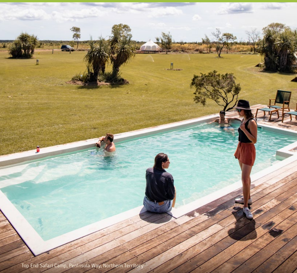
Top End Safari Camp, Peninsula Way, Northern Territory