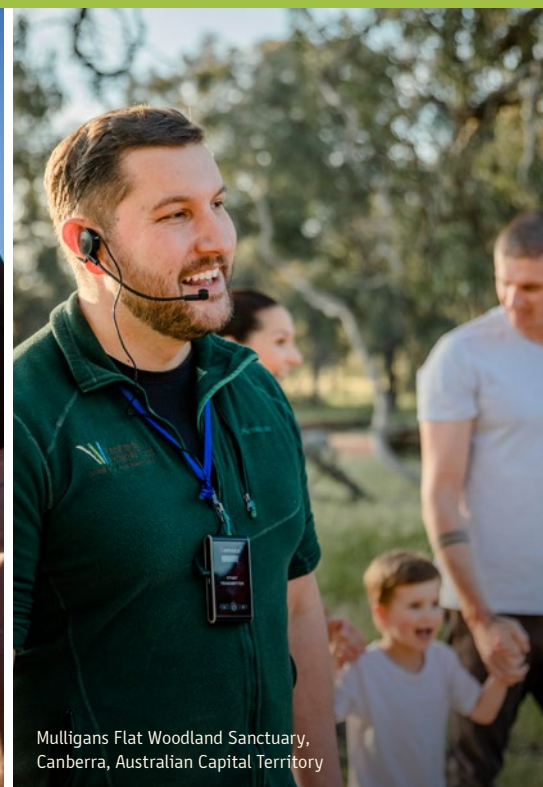
Mulligans Flat Woodland Sanctuary, Canberra, Australian Capital Territory

with endless beaches, waterways, and fantastic national parks to explore.