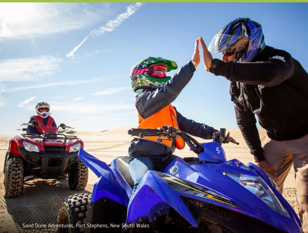
Sand Dune Adventures, Port Stephens, New South Wales