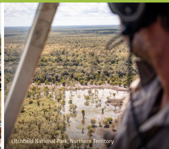
Litchfield National Park, Northern Territory