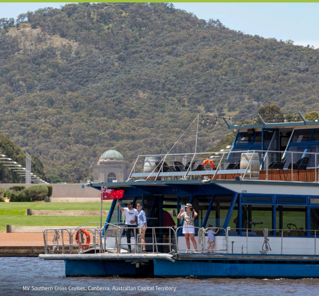
MV Southern Cross Cruises, Canberra, Australian Capital Territory