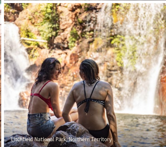
Litchfield National Park, Northern Territory