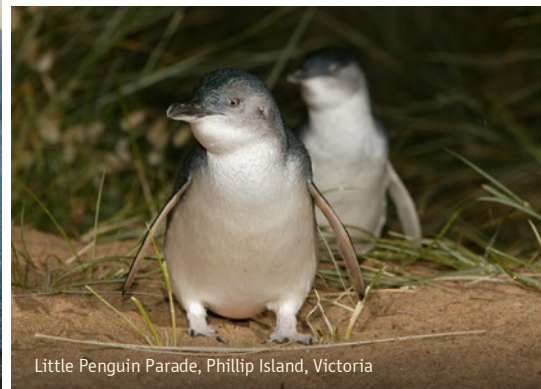
Little Penguin Parade, Phillip Island, Victoria

point of the Australian mainland, about a three-hour drive from Melbourne/Naarm (narr-m). It is a haven for nature lovers - you can walk remote coastal bushland trails, or swim in pristine beaches dominated by granite peaks. Accommodation inside the National Park is limited to camping and a few cabins, however in nearby Fish Creek and surrounds there are several comfortable options. Most options are for self-catering.