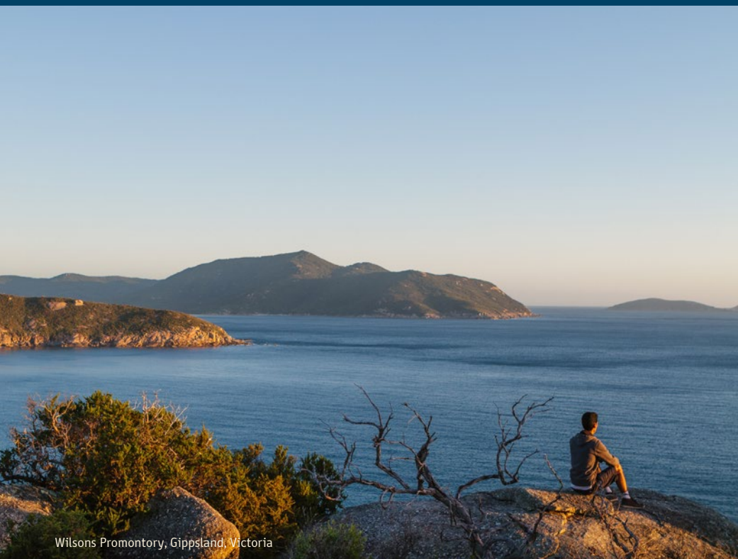
Wilsons Promontory, Gippsland, Victoria