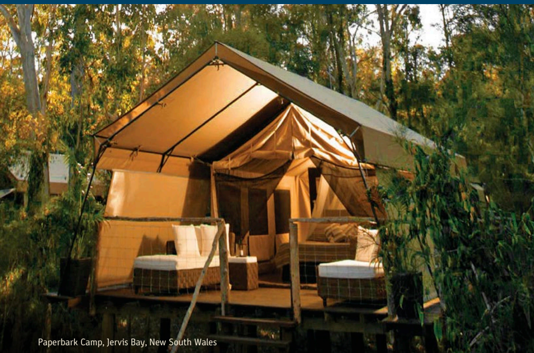
Paperbark Camp, Jervis Bay, New South Wales