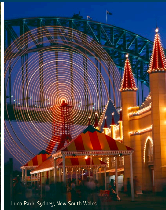
Luna Park, Sydney, New South Wales

Bay is a local secret although the word is quickly getting out. Magnificent marine life, pristine bushland and a chilled vibe create the perfect mix for both relaxed and fun-filled days. With some of the whitest sand in the world, aqua waters and fringed by tall shady gums you'll think you are in paradise.