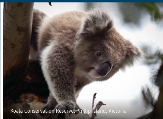
Koala Conservation Reserve, Phillip Island, Victoria