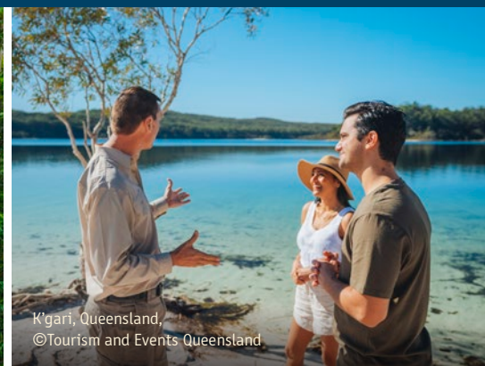
K'gari, Queensland