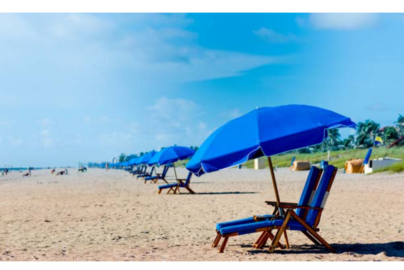
America's First Resort Destination™