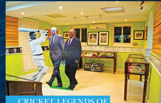
CRICKET LEGENDS OF BARBADOS MUSEUM

Situated around the corner from the Mecca of Cricket-Kensington Oval, you can bask in the ambiance created by the tales of the West Indian cricketing greats. This museum tells the story of our cricket legends, and characters of the game through photographs, memorabilia, uniforms, newspaper articles and even personal items of the legends themselves. It is truly awe-inspiring!