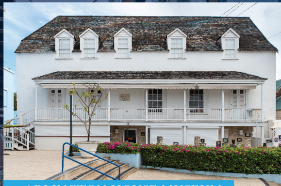
ARLINGTON HOUSE MUSEUM

Wander to the quaint and historic Speightstown for a truly unique and memorable experience at Arlington House Museum. Learn the history of Speightstown as an important trade port formerly known as Little Bristol, the history of sugar, and even trace your genealogy. This beautiful three-story building houses an interactive museum, which is perfect for all ages!