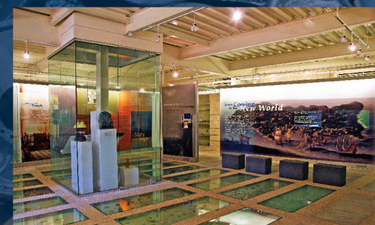
NIDHE ISRAEL SYNAGOGUE MUSEUM

Mon and Wed - Fri: 10:00a.m - 4:00p.m Saturday: 10:00a.m - 3:00p.m. Closed Tuesday (Group rates available)