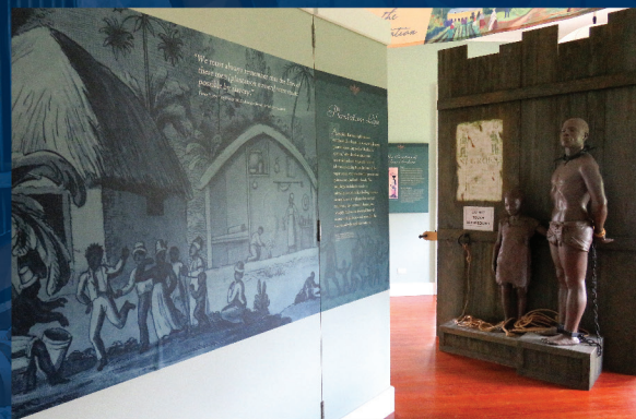
GEORGE WASHINGTON HOUSE

Monday - Friday: 9:00a.m - 5:00p.m Saturday: 9:00a.m - 3:00p.m