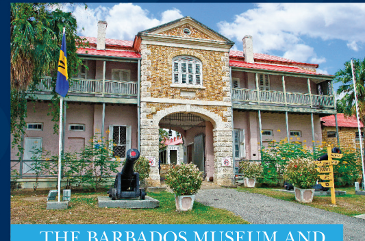
THE BARBADOS MUSEUM AND HISTORICAL SOCIETY

Located in Barbados' UNESCO World Heritage site, the Barbados Museum's galleries are housed in 19th century military prison buildings, and reveal the island's rich history. This museum is a full repository of Barbados, from the indigenous people, to the European settlers, colonialism, slavery, emancipation and independence. Get to know this beautiful island by immersing yourself in the history of its people.