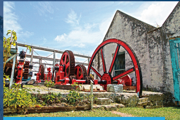
FRANK HUTSON SUGAR MUSEUM

Let the stories of Barbados' past mesmerise you, as you visit one of several museums, which tell the fascinating tales of a small but truly magnificent island.