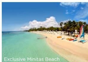
Exclusive Minitas Beach