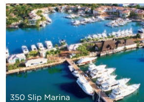
350 Slip Marina