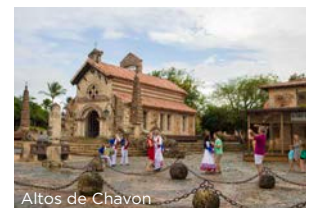
Altos de Chavon

Please contact our reservations specialists at 800-877-3643 casadecampo.com.do | res1@ccampo.com.do | La Romana, Dominican Republic